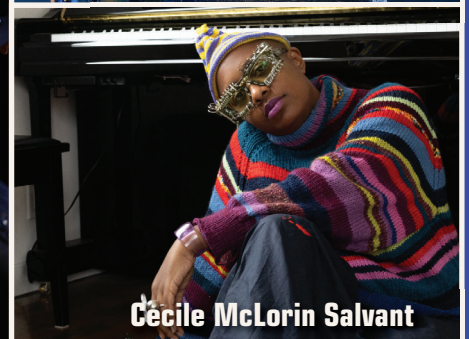
Cécile McLorin Salvant