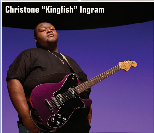
Christone "Kingfish" Ingram